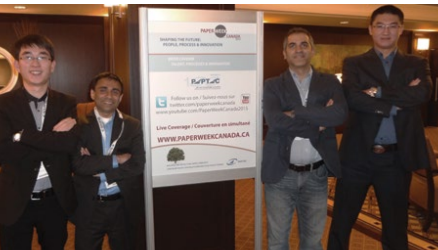
Below: Pulp and Paper Centre researchers at PaperWeek 2015