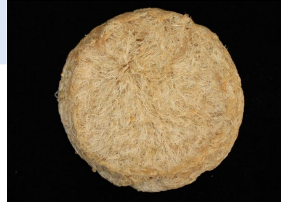
Composite incorporates bioactive live additives.

“Fibreglass insulation is effective,” admits Olson. “But our product won’t destroy your lungs or emit possible carcinogens—and the process is very easy and cheap.”